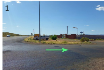
1 Turn onto Ethan Allen Way and set odometer to 0.0

From Page, drive 14.4 miles north on US 89 to Ethan Allen Way in Big Water and set your odometer to 0.0