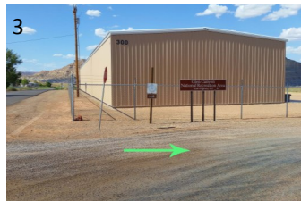
3 0.3 miles, Turn right onto Glen Canyon National Recreation Area (State Highway #12)