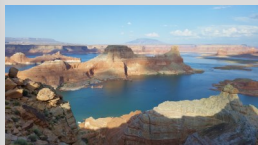
From Alstrom Point facing South East