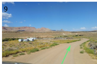
9 You should see a small ranching area on the left after a few minutes, then cross a small wash