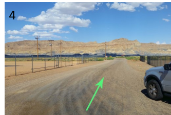
4 Go Straight on State Highway #12