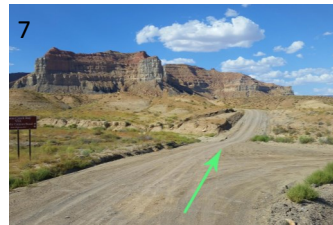
7 10.1 miles, stay left at split in road to stay on State Highway #12. Right goes to Warm Creek Bay VIA Crosby Canyon Road.