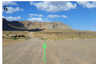
6 4.9 miles, pass the Wiregrass Canyon trailhead. Optional hike down to the river.