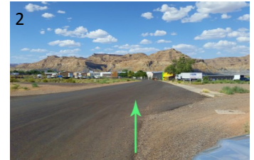
2 Go straight on Ethan Allen Way, use the parking lot on the right to offload ATV's if you are using them.