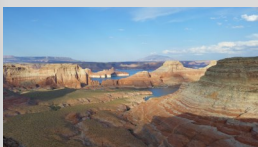
Lake levels can change the view from year to year