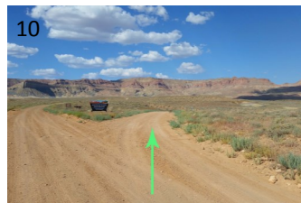
10 13.8 miles, turn right onto 340. Sign says Grand Staircase-Escalante National Monument