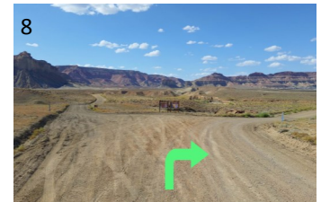
8 12.8 miles, turn right onto 300. Blue road marker on the right of the road. Information sign at the intersection has fun facts.