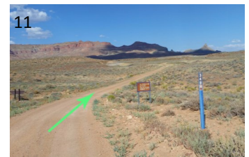
11 Blue road marker says Road 340. Brown sign says "All Vehicles and Bicycles must stay on roads."