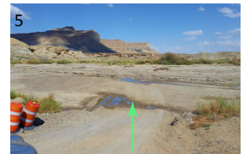
5 0.9 miles, cross Wahweap Creak. Often has flowing water, but usually not difficult to cross. Camp spot on the right before the river