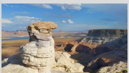
Big hoodoos are found in a couple of locations

Numbers on the map correspond to the numbers on the directional pictures. See Video, Pictures and more information at Alstrompoint.com